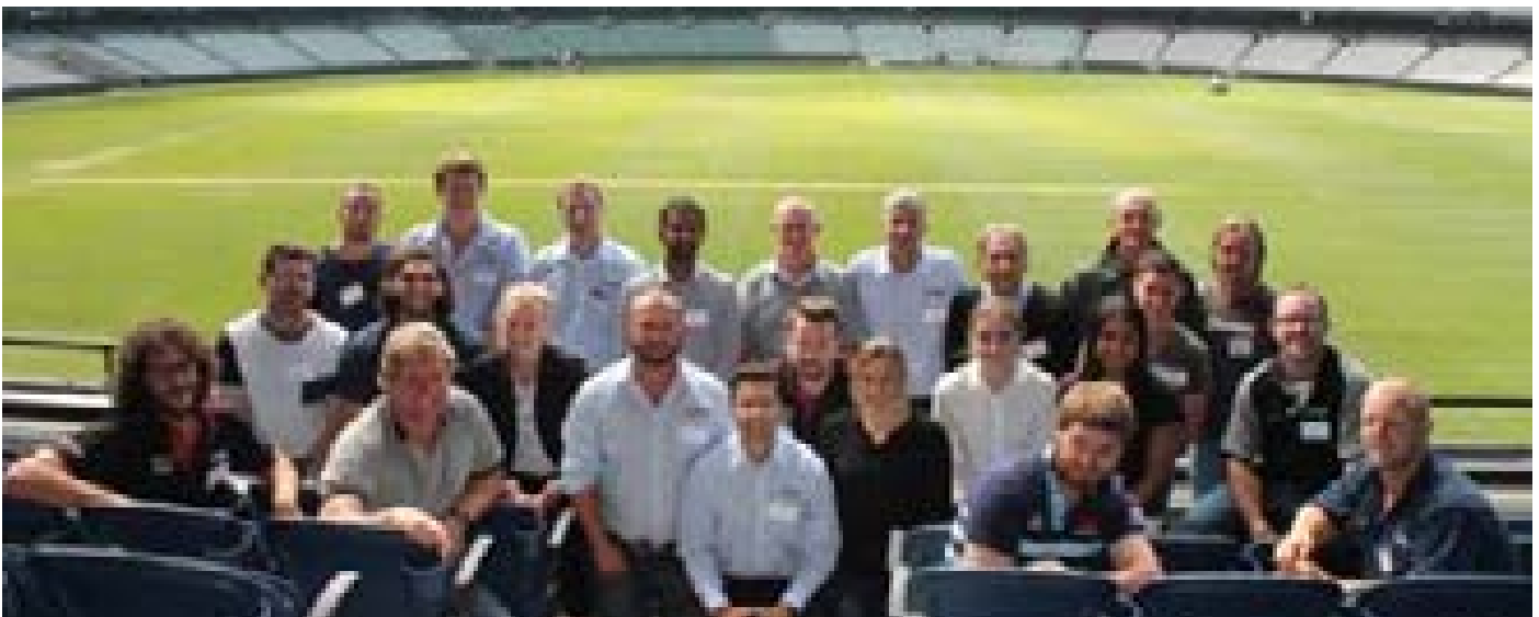
Finally, attendees were treated to a tour of the MCG (above). Thank you again to all our guests for making the time to attend.