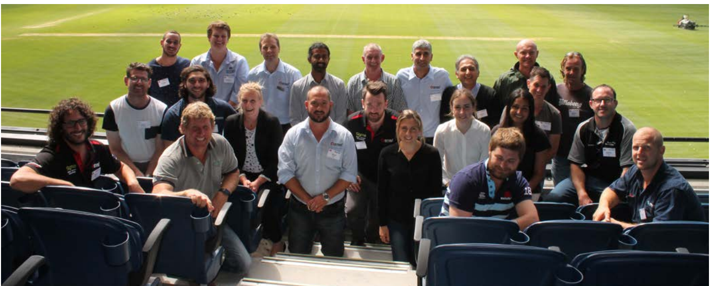
Finally, attendees were treated to a tour of the MCG (above). Thank you again to all our guests for making the time to attend.