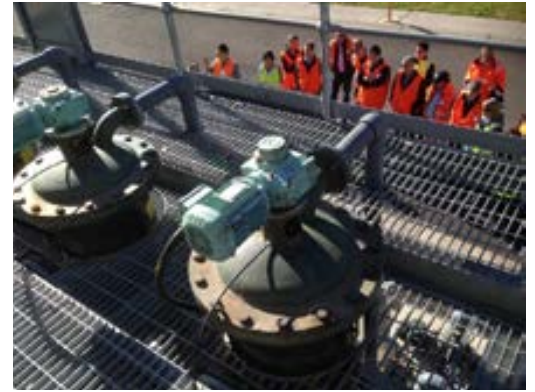
St. Marys Water Recycling Plant Tour Group