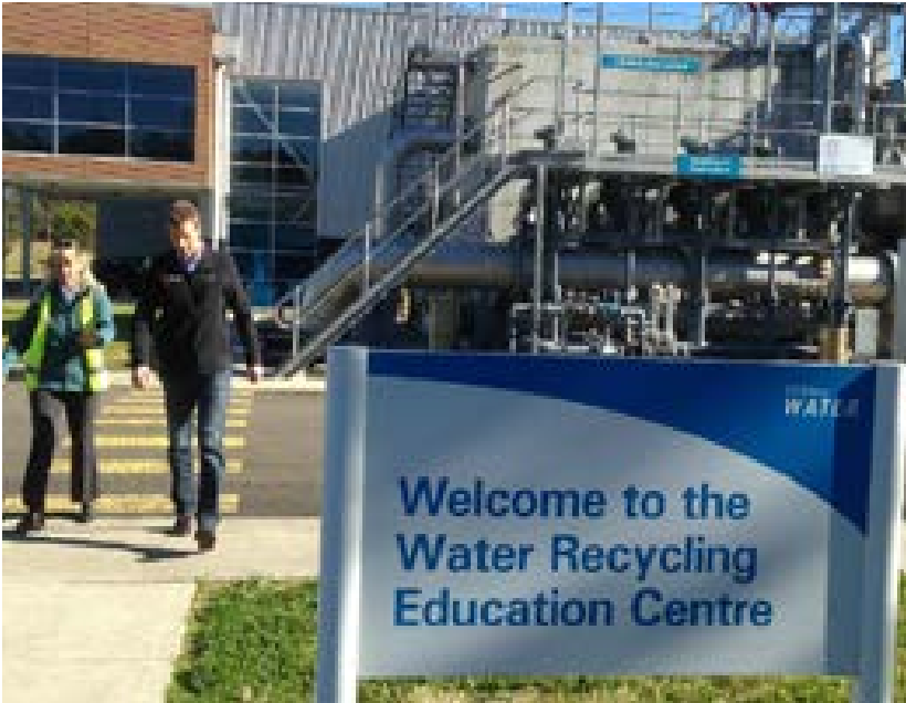
St. Marys Advanced Water Recycling Plant Tour